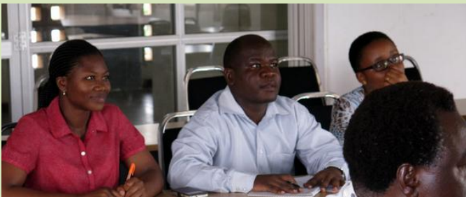
(Above) Sokoine University of Agriculture students participate in a postgraduate seminar sponsored by iAGRI, managed by Ohio State University.