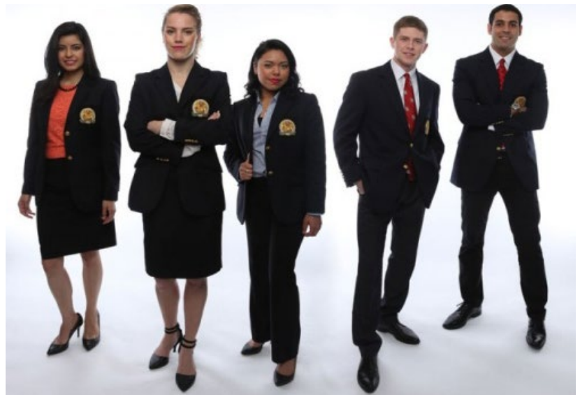
Wavve, a finalist at the 2104 DOE National Clean Technology Business Plan, also won $51K in cash and additional services in three other national B-plan competitions. The Wavve team has now founded a start-up company located at UH-ERP.

In a world dominated by an “innovation economy”, the U.S. suffers from a significant “innovation gap”. Entrepreneurship to support technology innovation is critical to the future economic prosperity of the nation. Ensuring that technically qualified workers understand and embrace entrepreneurship is equally important to future economic gains regardless of industry sector. To address these challenges, UH has developed a range of integrated, cross-disciplinary academic/experiential programming to provide both faculty and students with the “entrepreneurial” tools required to support technology innovation. Actively seeking local entrepreneurial community involvement in developing such programs has helped build capacity for commercializing both internal